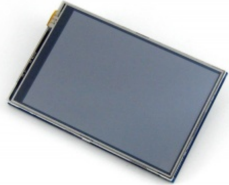
3.5inch RPi LCD (B) 320×480

3.5 inch Touch Screen TFT LCD Designed for Raspberry Pi